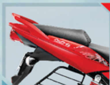
Body-Coloured Rear Grip