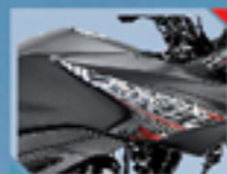
Matt Axis Grey