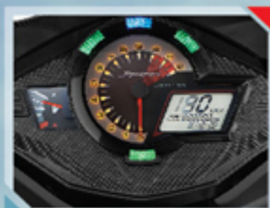
Digital-Analog Combo Meter Console