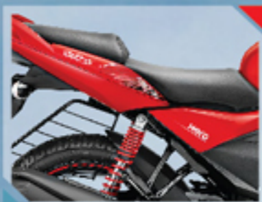
Stylish Split Seat