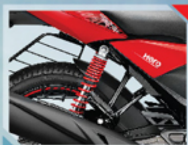
Adjustable Rear Shockers