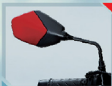
Dual Tone Rear View Mirrors