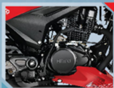
Maximum Power 8.2 kW ( 11.1 Ps ) @ 8000 rpm