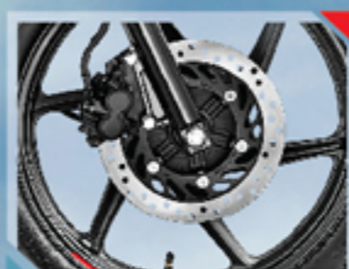
Front Disc Brake