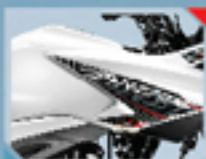
Pearl Fadeless White