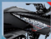
Panther Black Metallic