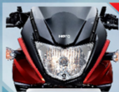
Classy Front Cowl with Trapezoidal Headlight