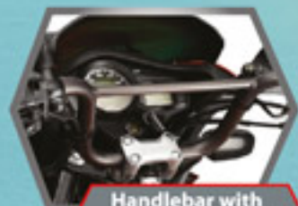
Handlebar with Crossbar