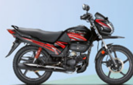
Black with Sports Red