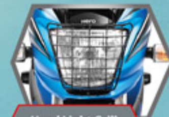
Head Light Grill