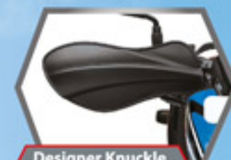
Designer Knuckle Guard