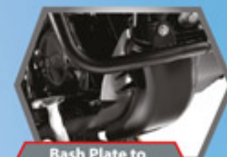
Bash Plate to Shield Engine