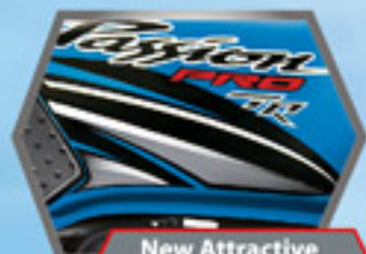
New Attractive Graphics