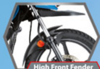
High Front Fender with Hugger