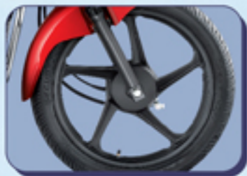
Black Alloy wheels