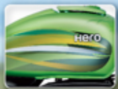
Leaf Green Metallic