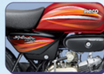
Exciting New Body Graphics

Available in the following colours with exciting new body graphics