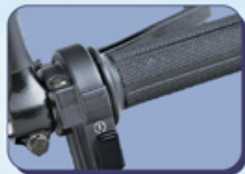
Convenient Power Start