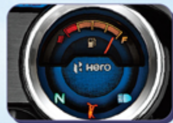
Side Stand Indicator