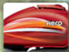
Candy Blazing Red

Available in the following colours with exciting new body graphics