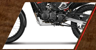
Increased Ground Clearance of 270 MM