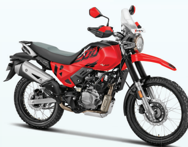
BLACK SPORTS RED