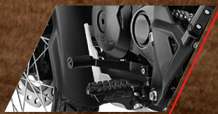
Extended Gear Lever