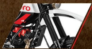
Adjustable Front Suspension of 250 MM