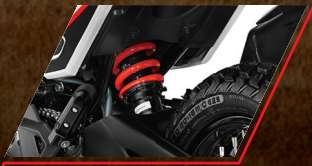
Adjustable Rear Suspension of 220 MM