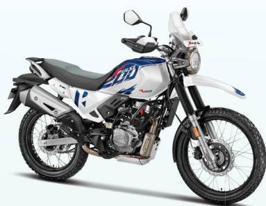
MATTE NEXUS BLUE