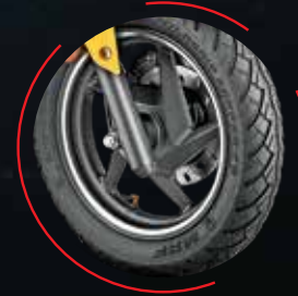
Diamond Cut Alloy Wheels