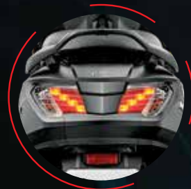
LED Tail Lamp