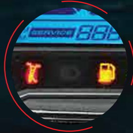
Side Stand Indicator, Low Fuel Indicator and Service Reminder

APART FROM BEING SMART, MAESTRO EDGE 125 IS DESIGNED TO GIVE YOU A COMFORTABLE AND EFFORTLESS RIDING EXPERIENCE.