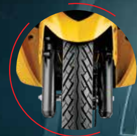
Telescopic Front Suspension