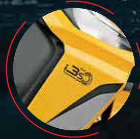
Revolutionary i3S + Technology