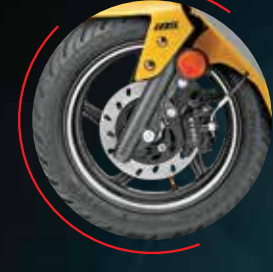
Disc Brake with IBS