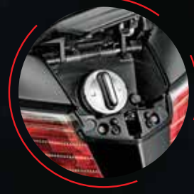
External Fuel Filling