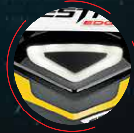
Striking LED Insignia