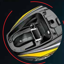
Mobile Charging Port and Boot Light