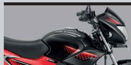
SPORTS RED BLACK