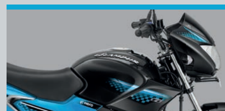
TECHNO BLUE BLACK

Regd. Office: Hero MotoCorp Limited, The Grand Plaza, Plot No.2, Nelson Mandela Road, Vasant Kunj - Phase -II, New Delhi - 110070, India. CIN: L35911DL1984PLC017354. Phone No.: 011 - 46044100. For further information, contact nearest Hero MotoCorp authorised outlet or call our toll free no.: 1800 - 266 - 0018 or visit us on www.heromotocorp.com . Accessories and features shown may not be part of standard fitment. Always wear a helmet while riding a two wheeler.