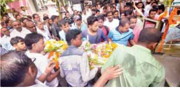
Journalists paying floral tribute to photo journalist Santanu Bhowmik at Press club in Agartala on Wednesday