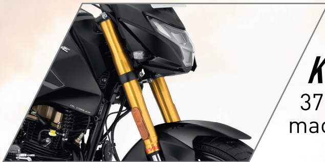
KYB USD Forks 37mm Dia for a macho stance.