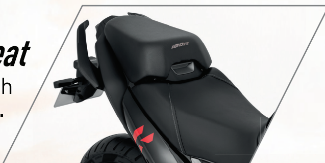
All new Split Seat Interchangeable with single seat.