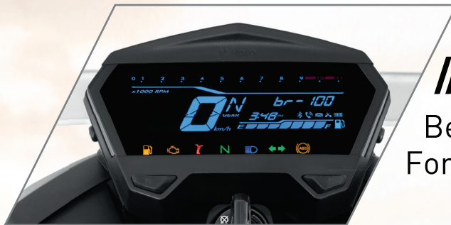
Inverted LCD Display Be it bright or dark. For you, it'll be perfect.