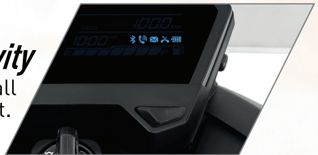
Bluetooth Connectivity Never miss a call or text alert.