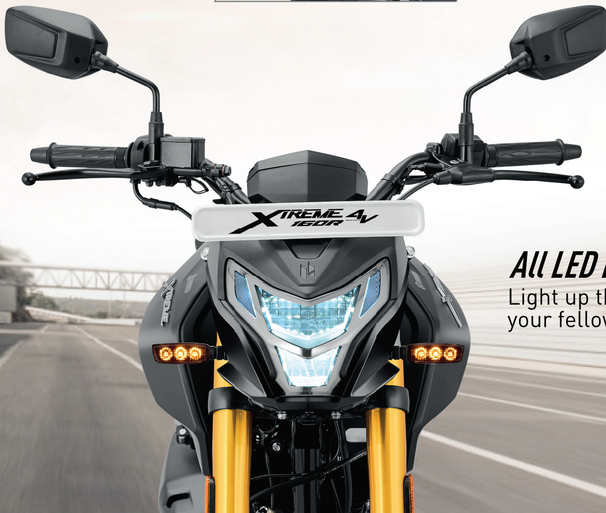
All LED Lights Light up the road for your fellow dragsters.