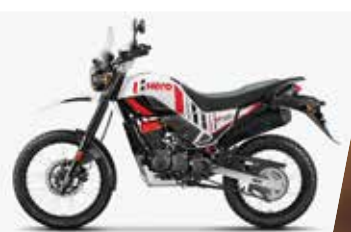
INCREASED GROUND CLEARANCE OF 270 MM