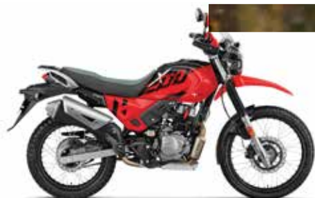
BLACK SPORTS RED