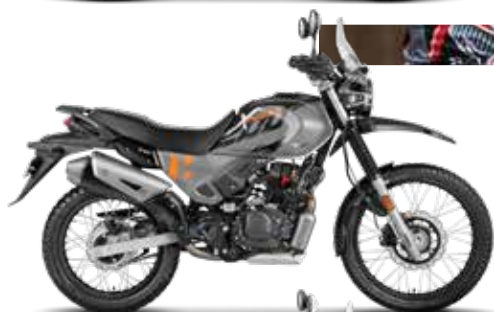
INDUSTRIAL DARK GREY