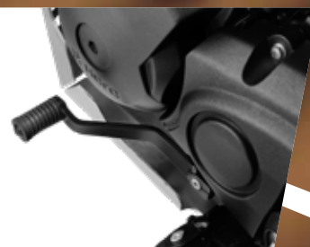
EXTENDED GEAR LEVER