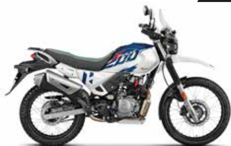
MATTE NEXUS BLUE