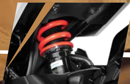
ADJUSTABLE REAR SUSPENSION OF 220 MM