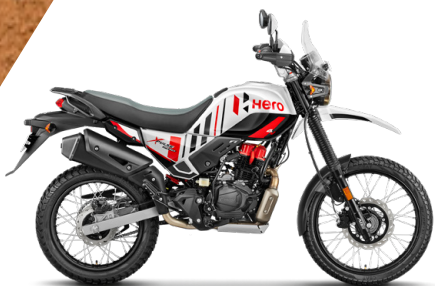
Rally Edition White (pro variant)

Pictures shown are for illustration purpose only and may not be exact representation of the product. It is our endeavour to constantly improve the product. This could lead to change in product specifications without any notice. Accessories & Feature shown may not be part of standard fitment. Actual colour of the vehicle may differ from those shown in the picture.