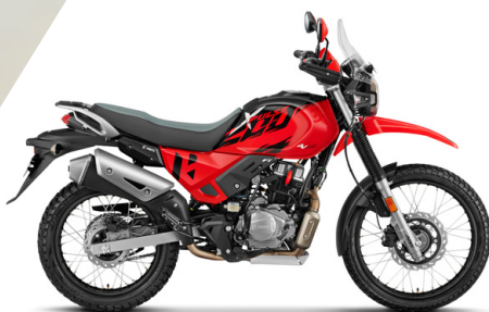
Black Sports Red