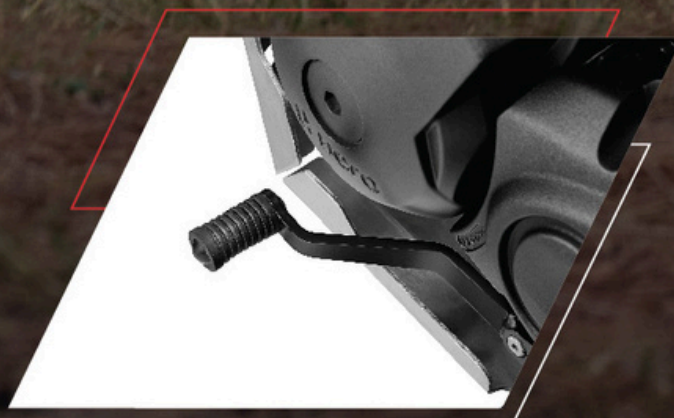
EXTENDED GEAR LEVER