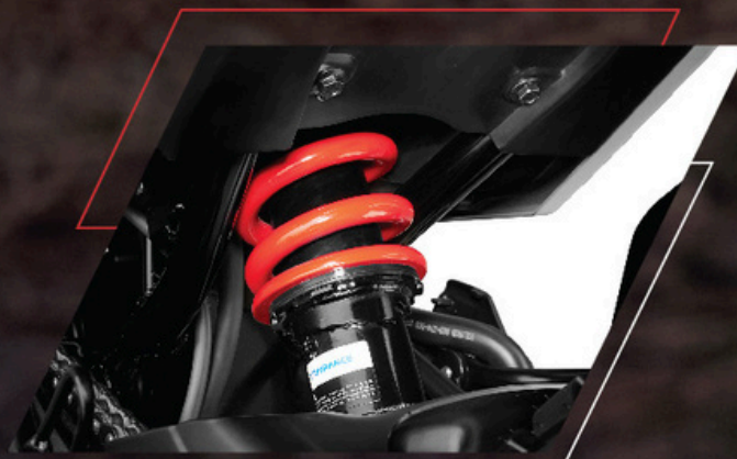
ADJUSTABLE REAR SUSPENSION OF 220 MM