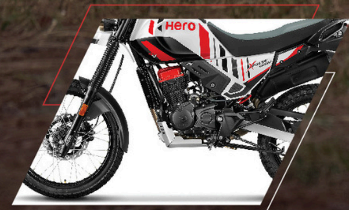
INCREASED GROUND CLEARANCE OF 270 MM