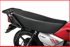
LONGER SEAT AND REAR CARRIER