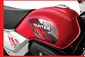
12.5 LITRE FUEL TANK