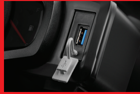
INTEGRATED USB CHARGER