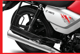
LONGER PILLION STEP