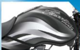
BLACK WITH HEAVY GREY