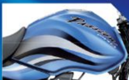
BLACK WITH FROST BLUE