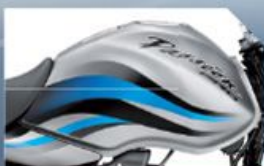
FORCE SILVER METALLIC