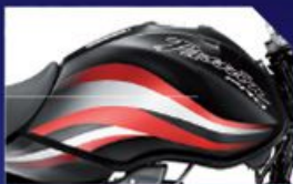
BLACK WITH SPORTS RED