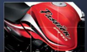
NEW MUSCULAR FUEL TANK