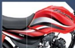
STYLISH NEW GRAPHICS