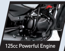
125cc Powerful Engine