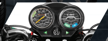
BEST IN CLASS MILEAGE