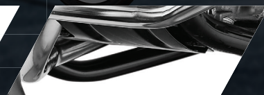
METALLIC BASH PLATE