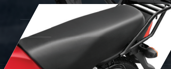
EXTRA LONG COMFORTABLE SEAT