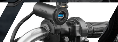
USB PORT – CHARGING ON THE GO