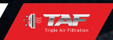
TRIPLE AIR FILTRATION

With an automatic self-start button and a wide, comfortable seat, it is always reliable to get you where you are going.